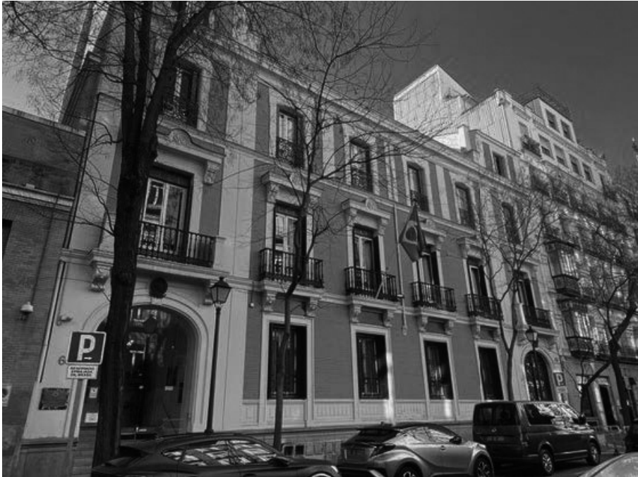
“Building of the Brazilian Embassy in Madrid.” https://www.gov.br/mre/pt-br/embaixada-madri/madri-arquivos/historia-do-edificio-da-embaixada .