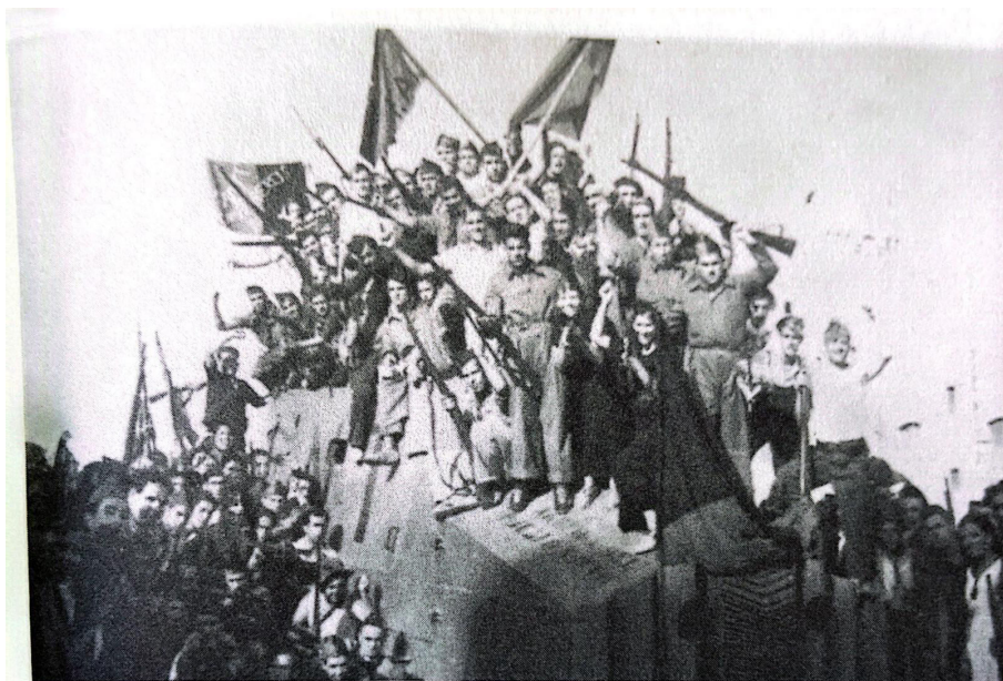
13. Spanish Civil war 1936–39: anarchist militia in Barcelona, 1936, on an improvised armoured vehicle.

What the rebels had initially envisioned as a swift uprising, an alzamiento , escalated into a long and exhausting conflict (Preston 2016). Initially, despite the outbreak of hostilities, the Republican government maintained its official headquarters in Madrid. However, as Nationalist troops advanced, in November 1936, the Second Republic government decided to temporarily relocate to Valencia for security reasons.